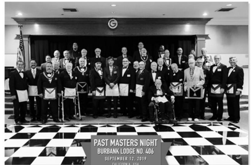
Third Degree Past Masters Night