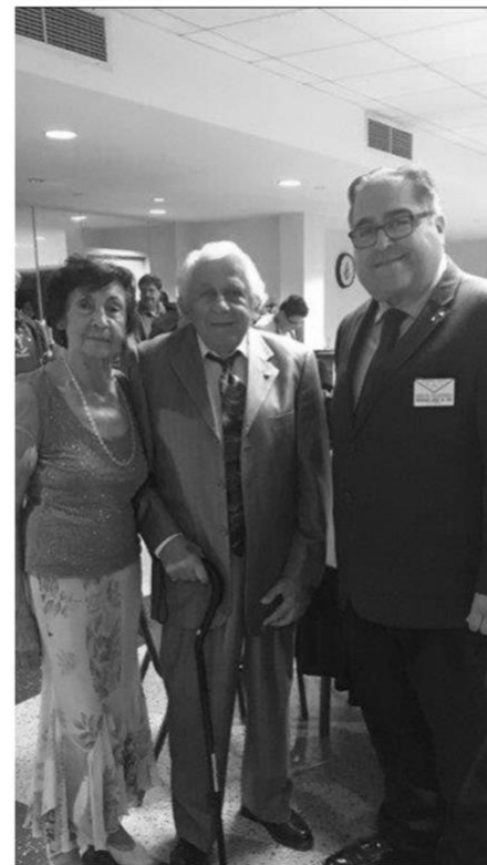
50 Year Presentation