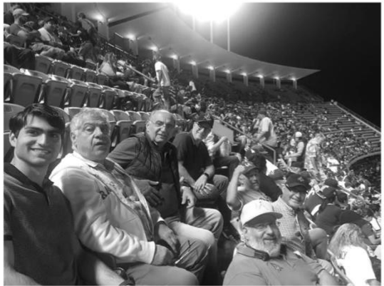
Dodgers Masons Night